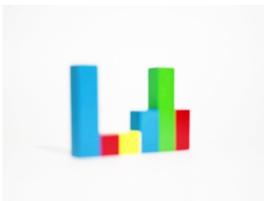
「blocks#13」 2010, digital chromogenic print