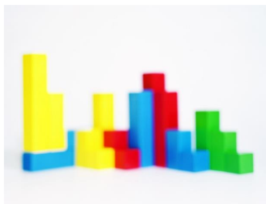
「blocks#20」 2011, digital chromogenic print